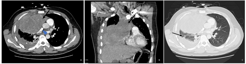
FIGURE 1: CT Chest Evaluation

Axial (A) and coronal (B) contrast-enhanced CT images in soft tissue window demonstrate a large right anterior mediastinal soft tissue mass (arrows) which is largely hypodense with heterogenous enhancement. This mass is effacing the right middle lobe, narrowing of the SVC (arrowhead in A), and causing leftward displacement of the mediastinum. Axial image (A) also demonstrates a small right pleural effusion (asterisk) with adjacent atelectasis. (C) Axial contrast-enhanced CT image in lung window demonstrates the compressive atelectasis (arrow) surrounding the small right pleural effusion to a better extent. A differential based on images and patient's age includes lymphoma, neurogenic tumor, neoplastic thymoma, or other neoplasms.