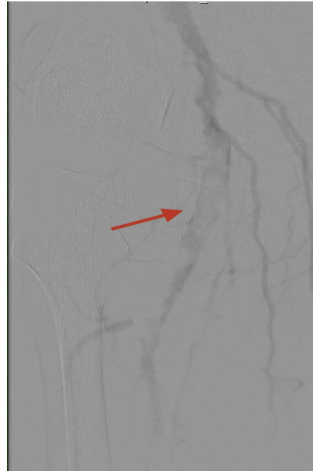
Fig. 2. Peripheral angiogram showing clot in tibio-peroneal trunk.

A 70-year-old male patient with past medical history of hypertension presented to emergency department with right leg pain and swelling. COVID-19 was diagnosed on the basis of reverse transcription polymerase chain reaction testing in the prior week before presentation at a clinic. Vital signs on presentation were as follows: heart rate, 71 beats/min; blood pressure, 121/66 mm Hg; oxygen saturation, 100% on room air; and temperature,