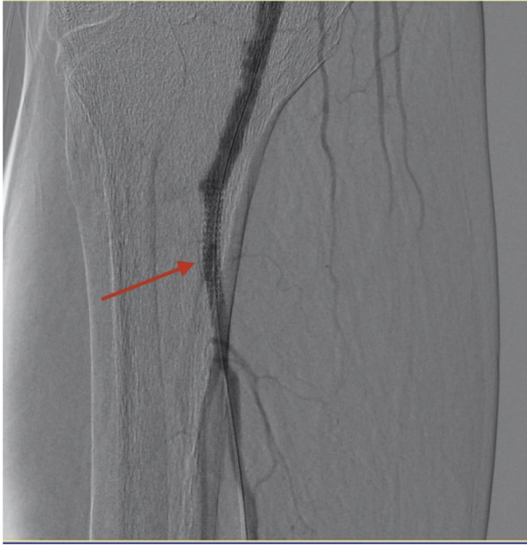
Fig. 3. Peripheral angiogram before stenting of tibioperoneal trunk.