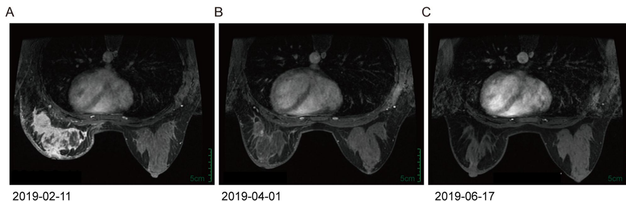
Figure 3 Breast MRI imaging. Notes: (A) MRI presents with a left breast mass (8.7cm in diameter) which was apparently intensified before treatment. (B) The imaging was scanned after 2-cycle treatment with PTPC (the combination of pyrotinib, trastuzumab, paclitaxel and cisplatin). It shows us a significant decrease in lesion size (0.7cm in diameter) and visibly reduced lymph node size in the left armpit, which was evaluated as a clinical partial response (cPR). (C) After 4-cycle treatment with PTPC, the imaging results were similar to those seen in the right breast on the imaging, suggesting a response close to a clinical complete response (cCR).