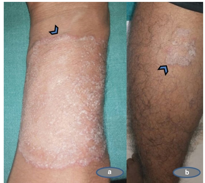
Fig. 1. Description of lesions of Tinea in an immunocompetent Indian male. (a) Circinate scaly plaques with a well-defined erythematous scaly plaque of size 5x6 cm with papules in the border on the flexor aspect of the right forearm (arrowhead); (b) Erythematous irregular scaly plaques over the lower part of the lower leg of size 2x2 cm (arrowhead).

On further examination, similar lesions were seen in the lower abdomen, groin and the gluteal region (not shown