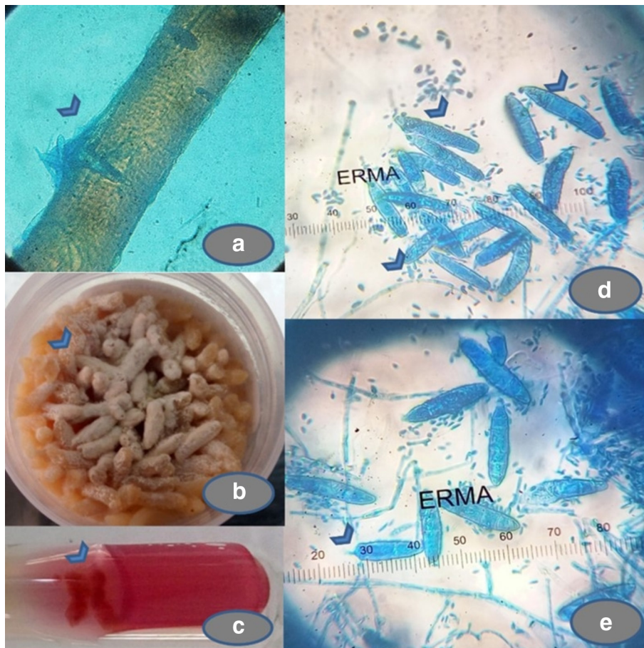
Fig. 3. Physiological and morphological features of the isolate. (a) Perforating organs on sterile pre-pubescent hair in vitro (arrowhead). (b) Powdery growth with brownish pigment on sterile polished rice grain inoculation (arrowhead). (c) Hydrolysis of Christensen's urea medium with 10 days of inoculation (arrowhead). (d, e) Lacto phenol cotton blue (LPCB) mount showing a moderate number of teardrop shaped microconidia (arrowheads), measuring 2–3×5–8 μm smooth walled and are borne laterally on the septate hyphae, arranged in solitary and small groups were seen. Numerous spindle-shaped macroconidia (arrowheads), thin-walled and echinulate surface (arrowheads) with 4–6 septa (arrowheads) and measuring 150×15 μm (arrowhead) and a few of them showing blunt tips (arrowhead).

Molecular identification of the culture was performed at the NCCPF, PGIMER, Chandigarh, India, by sequencing the ITS region of the rDNA using the universal primer pair ITS-1(5'-TCCGTAGGTGAACCTTGCGG-3') and ITS-4