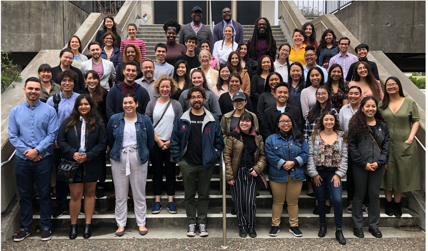
Fig 1. Group photo of the participants, mentors, and faculty of the 2019 Big Data Summer Program at the Summer Research Symposium.

https://doi.org/10.1371/journal.pcbi.1007833.g001