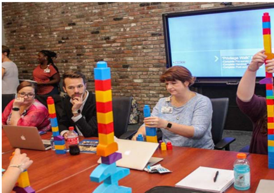
FIG. 1. MPW. This figure portrays health care studies students building a tower based on their privilege score from a MPW in their fall 2019 social determinants of health course. During the MPW, students completed a handout related to race/ethnicity and socioeconomic status. Students then calculated a “privilege score” and used that score to get Legos and build a tower. Some students had a negative score or zero, so those students did not receive any Legos. MPW, modified privilege walk. Photo printed with permission.

nor our students, would have ever imagined the application of privilege as SDOH during a pandemic.