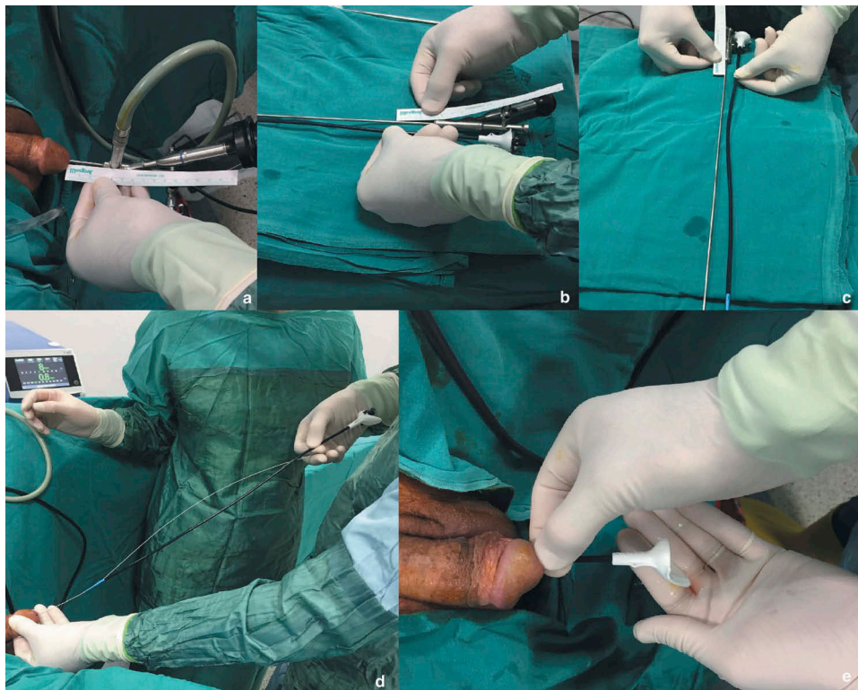
Figure 1. The step-by-step ffURS procedure: (a, b, c) The measurement of ureteric length for insertion of the ureteric access sheath after the semi-rigid URS. (d) Insertion of the ureteric access sheath over the guidewire. (e) Control of the ureteric access sheath placement with the urine drainage from the renal pelvis.