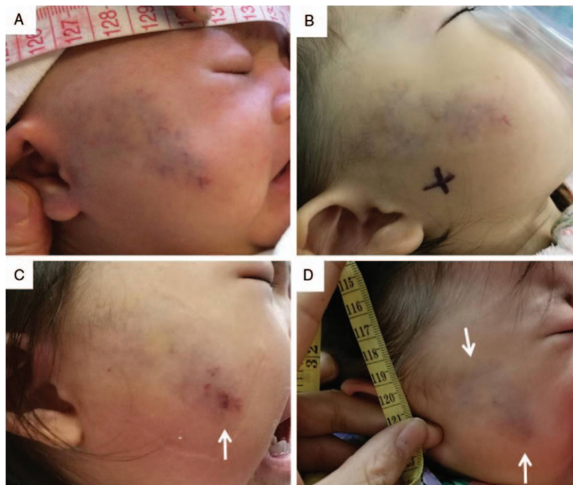
Figure 3. A 20-month-old female with a small diffuse venous malformation involving the right face region. (A) Lateral view of the lesion when she was 1-month-old. (B) PS treatment with polidocanol was performed when she was 20-month-old. (C) One day after the PS session, swelling, skin blanching (poor capillary refill) and skin ecchymoses (arrow) were noticed on the right face. (D) One month after the PS session, significant reduction in size and color fading of the lesion were noticed (arrow). There was no skin necrosis or scarring (arrow). PS = percutaneous sclerotherapy.