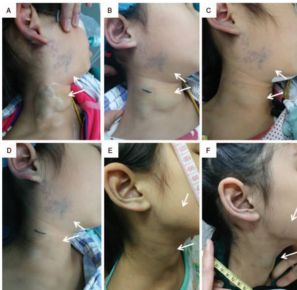
Figure 1. A 6-year-old female with a large diffuse VM involving the right face and neck region. (A) Lateral view of VM during the first PS session. The lesion was superficial, blue, compressible and soft on palpation. The boundary of the lesion was not clearly defined. (B) One month after the first PS session, during the second PS session. The volume of the lesion did not significantly change. (C) One month after the second PS session, during the third PS session. The lesion was smaller and flat. (D) One month after the third PS session, during the fourth PS session. (E) Three weeks after the fourth PS session, significant reduction in size and color fading of the lesion were noticed (arrow). (F) 18 months after the fourth PS session, although partial VM remained, the desired goal of treatment was achieved. PS = percutaneous sclerotherapy, VM = venous malformation.

The location of the VMs was in the head and neck in 16 cases (34.0%, Figs. 1–3), upper extremity in 11 cases (23.4%), lower extremity in 10 cases (21.3%), and trunk and perineum in 10 cases (21.3%). The majority of the lesions were focal in 36 cases (76.6%, Fig. 2), while 11 (23.4%, Figs. 1 and 3) were diffuse. Lesion characteristics are listed in Table 2.