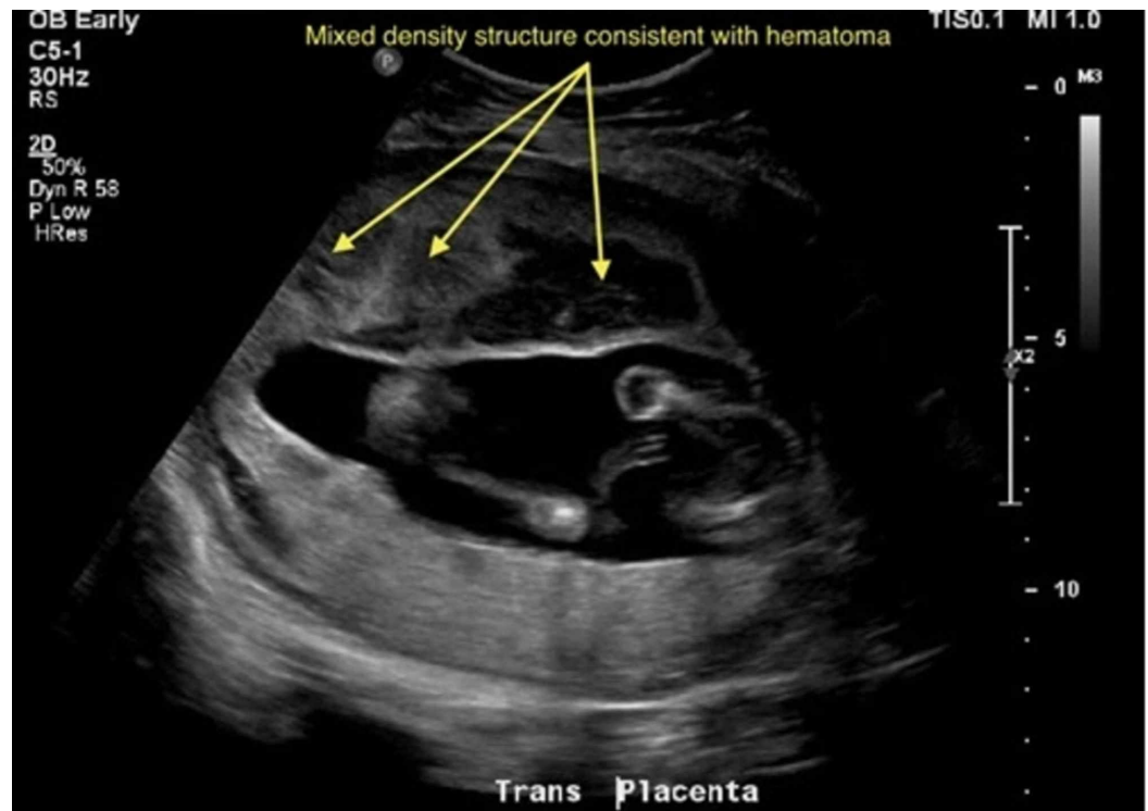
FIGURE 2: "U/S OB trauma limited" post motor vehicle collision, showing notable anterior echogenic material, which appears heterogeneous in echotexture with hypoechoic areas measuring 12.0 x 5.4 x 9.5 cm

U/S, ultrasound; OB, obstetric; findings were concerning for placental abruption.