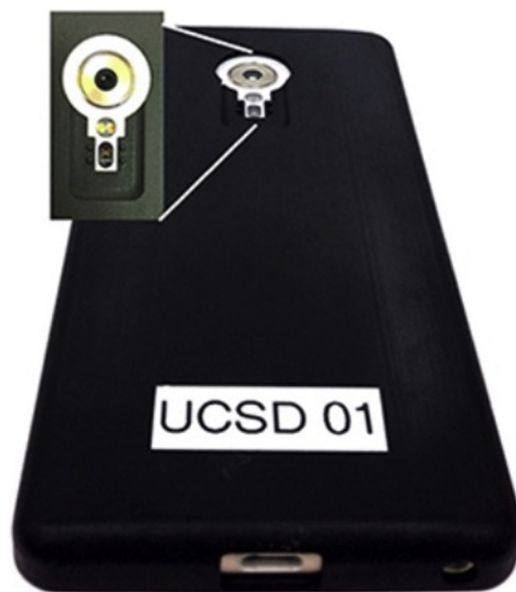
Figure 1 – Smartphone with embedded photoplethysmography sensor suite and plastic case with braille guide for digit placement used as the test instrument.

and signal-processing algorithm MaximFast) (Maxim Integrated). The phones were enclosed within plastic cases (Fig 1) containing a circular indent with raised grooves to guide and stabilize finger placement over the PPG sensor. Vital sign measures were obtained simultaneously using two “reference standard of care” Welch Allyn Spot Vital Signs (WASVS) units [models (91)42NTB and (93)2268; Welch Allyn]. Participants were adults over 18 years of age recruited from UCSD Healthcare or Clinical Trials Units and who provided written informed consent. Initially, participants were recruited from outpatient settings (n = 250). For each participant, four pairs of measurements (total, eight data points) were taken in succession, with no break between sets, in the order indicated in Table 1 (top). This is a repeated measure, nested-factorial design, with three factors (measurement system, left/right index finger, experimental step), instrument units nested within measurement system (two units for each system), and repeated measures over participants. 21 This design allows statistical evaluation