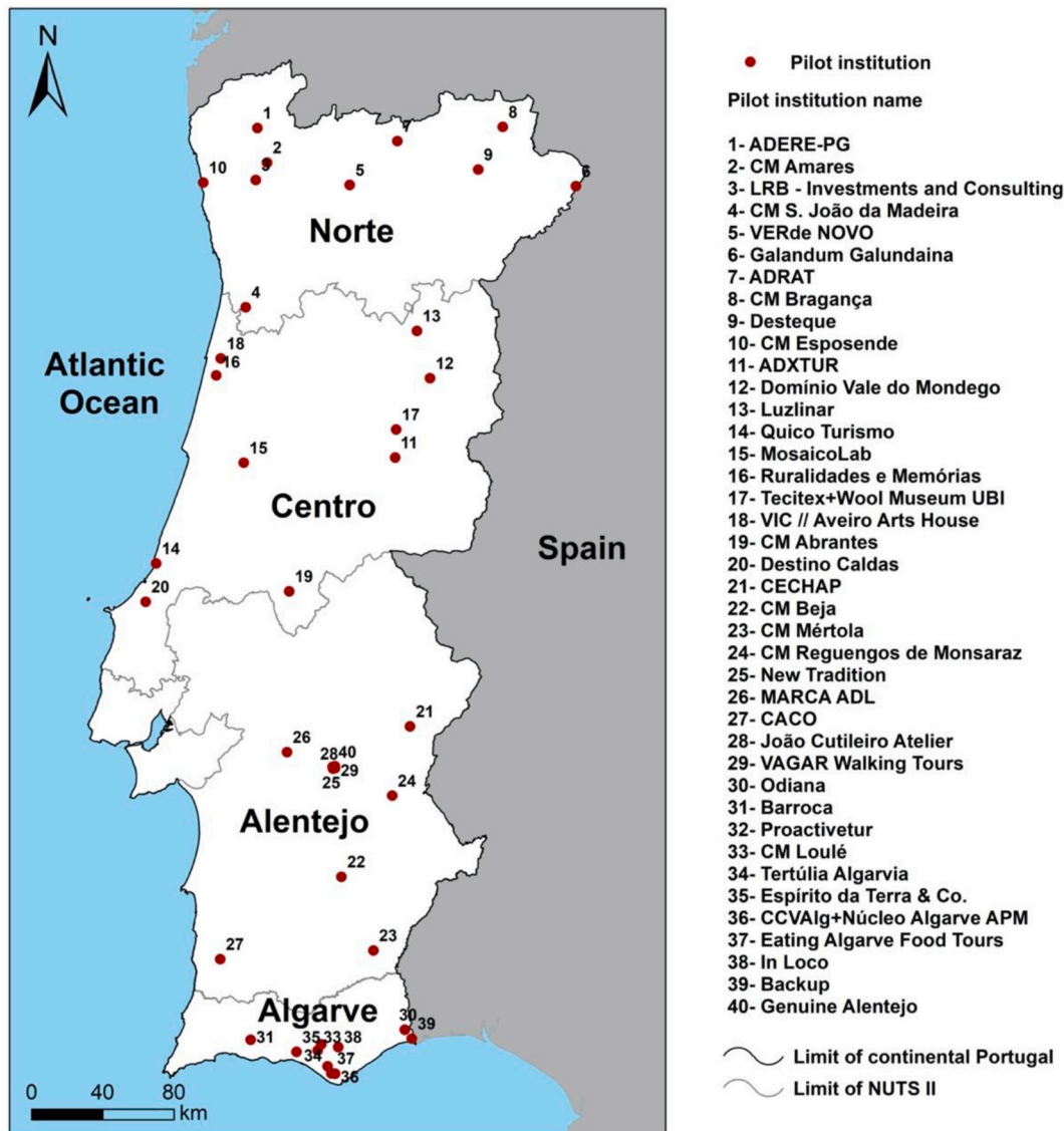
Fig. 1. Map of locations of the CREATOUR pilots.