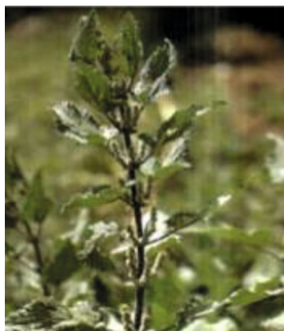
Utric simensis Steudel