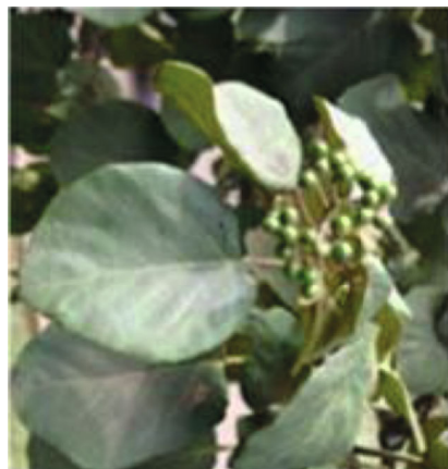
Cordia africana Lam