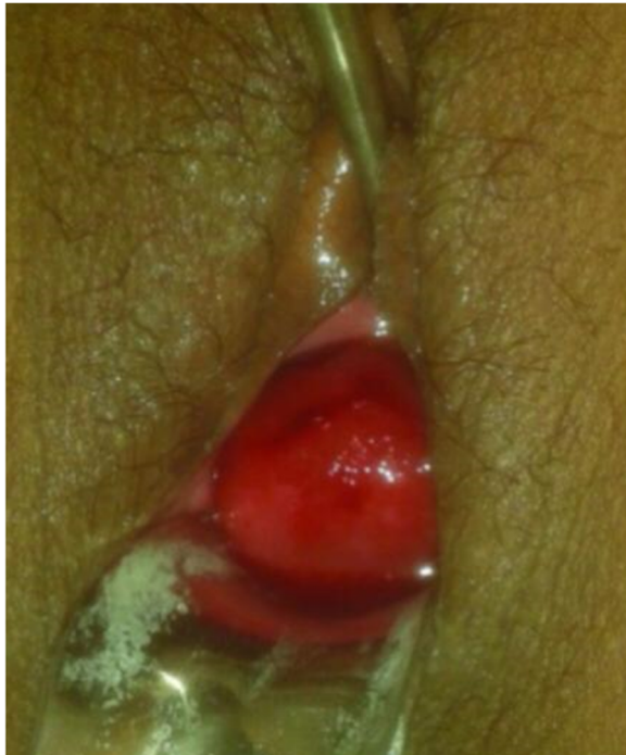
Fig. 1 Inverted fundus of the uterus upon per speculum examination presenting as vaginal mass

spectrum antibiotics (injection linezolid 1.2 g twice daily, injection gentamicin 80 mg twice daily, and injection metronidazole 500 mg thrice daily for 2 days) and after transfusing 2 units of packed red cells.