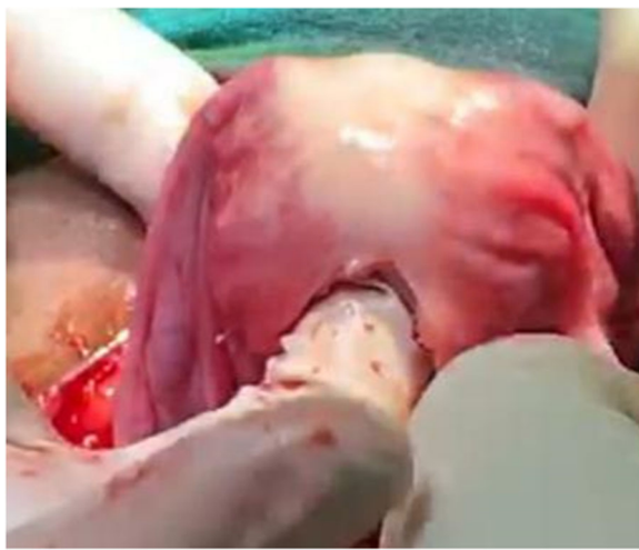
Fig. 4 Repositioning of the uterus

weeks after delivery). Acute uterine inversion is a potentially fatal complication of a mismanaged third stage of labor, leading to severe postpartum hemorrhage and shock; if not managed aggressively, it can prove lethal. Incomplete acute uterine inversion may be overlooked due to mild or no symptoms [3] and inexperience of untrained birth attendant. It later can advance to chronic symptoms, as seen in our patient's case. This could be the reason for the late presentation in our patient, who reported to us 8 months after delivery. A similar case was reported by Ali and Kumar who presented with chronic uterine inversion six months after mismanaged delivery at home by an untrained birth attendant [2]. The likely cause in our patient could have been aggressive fundal pressure in the second stage of labor due to inadequate bearing-down efforts, short umbilical cord, and excessive traction on the cord before the signs of placental separation [3], as suggested by the history given by the patient. The inversion could have been incomplete at that time, which later advanced to chronic inversion with time.