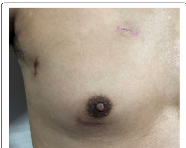
Scar spread 2, Erythema 1, Dyspigmentation 1, Suture marks 0, Hypertrophy 1, Overall impression 0