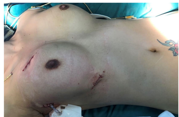
Fig. 2 Sutured incision after the totally thoracoscopic cardiac surgery

All the scars were assessed and photographed under standard conditions and then scored based on the SCAR scale and the NRS. Each scar was rated by two independent observers who had been trained to use the SCAR scale. The observers were experienced residents who were experts in the patients' follow-up care. The scores given by this pair of observers were documented for the reliability test. The two observers then discussed and assessed each scar and gave a final score. If the two observers disagreed with this score, a third observer (experienced surgeon) was included in the evaluation, and the final score was determined. The patients were blinded to the scores. Figure 3 shows the application of the SCAR scale in assessing the study cases.