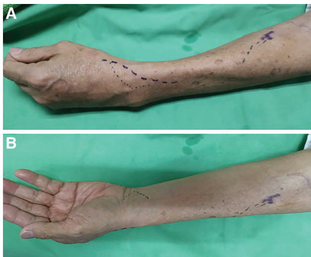
Fig. 2. Markings on the patient for infiltration with the WALANT solution. A, Dorsoradial aspect of the forearm. B, Volar aspect of the forearm.