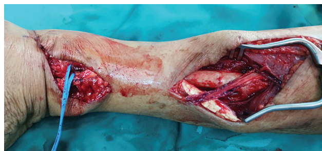
Fig. 5. Pronator teres with periosteal extension has been stripped off the bone and is ready to be sutured to ECRB.

movement by the awake patient during the surgery to be helpful in the finer adjustments of correct transfer tension.