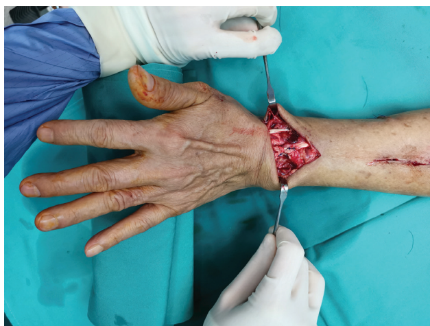
Fig. 3. Patient actively extending his thumb and fingers fully after transfer of PL to EPL and FCR to EDC.