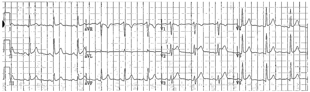
FIGURE 1: ECG on presentation

echocardiogram was performed and showed normal left ventricular ejection fraction of 55% without regional wall motion abnormality or pericardial effusion.