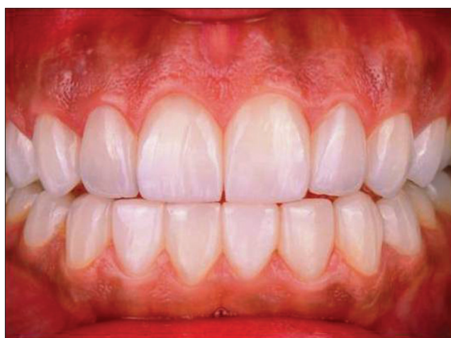
Figure 2: Do you find this smile attractive?