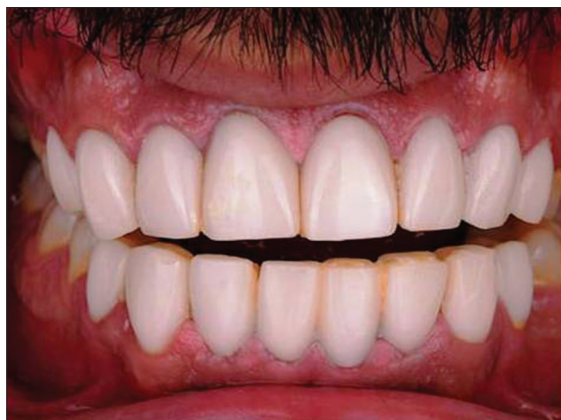
Figure 1: Do you find this smile attractive?