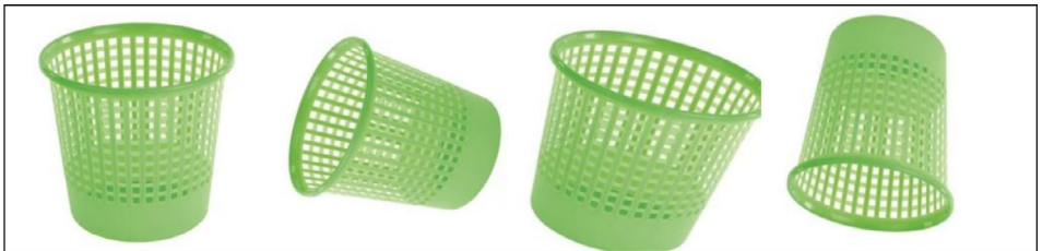
Fig. 2. Example of an object in MYNursingHome dataset at different orientations.

and dementia. Most of them are unable to manage their daily routine on their own because of these problems. Intelligent assistive system for indoor object detection and recognition is required to encourage these people to move independently.