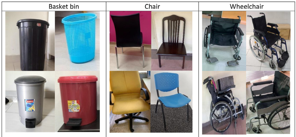
Fig. 1. Some of the images and categories in MYNursingHome dataset.