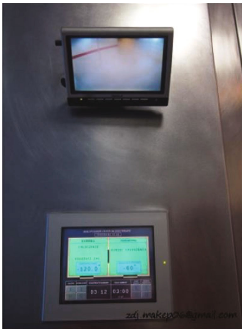
FIGURE 2: Camera and monitor indicating temperature inside the chamber.

the result was statistically significant in comparison to measurement 4 to measurement 1 ( p = 0.043 ). Changes in the level of hydration of the epidermis of both healthy skin and the skin with AD symptoms were also observed. In places where atopy symptoms occurred, the skin was drier as compared with the healthy area (Table 1). Furthermore, the results indicate that hydration of the epidermis in the involved skin increased directly after the 1 st treatment and after 3 weeks from the last treatment (2 vs. 1 ( p = 0.015 ) and 4 vs. 1 ( p = 0.010 ), respectively) (Table 2).