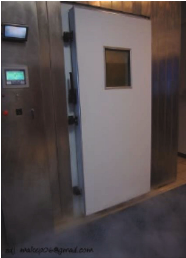
FIGURE 1: Entrance to the cryochamber (author's photograph).