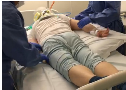
Figure 1 Proning in non-invasive ventilation (NIV).

We put the patients in a prone position with the help of specialised nurses (video 1). The patient was initially put supine on the border of a two-point movement bed with a water antidecubital mattress. A pillow was slid laterally under the chest and abdomen and the patient was prepared for turning with one arm on his abdomen and a leg crossed over the other. The nurses then slowly rolled the patient into a prone position and adjusted the helmet and the position of the head and arms (figures 1 and 2). The physician checked the helmet and the NIV pressures to verify the compliance of the patient with the procedure. In order to increase the compliance to NIV and reduce the anxiety linked to the situation, a continuous morphine infusion of 20–30 mg/day was started, which improved the patient's compliance. After 1 hour of proning at the above settings, ABG showed an improvement in PaO 2 /FiO 2 ratio for all the patients (median 97±8 mm Hg). Lung US after 1 hour of prone position showed no differences in B line quantity and distribution.