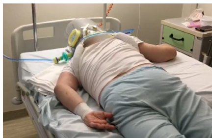
Figure 2 Prone position.

Based on our experience, we believe that prone NIV CPAP could be an option for patients non-responsive to traditional NIV CPAP with helmet from whom ICU care is not quickly available.