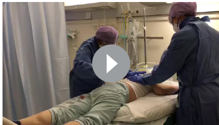
Video 1 Two specialised nurses proning a compliant patient with ongoing helmet non-invasive ventilation (NIV)

patients had laboratory findings as reported in COVID-19 infection, 1 such as lymphocytopenia, increased aspartate transaminase, elevated lactate dehydrogenase and C-reactive protein (table 1). Lung US showed B lines, pleural line irregularities in most fields and spared areas bilaterally. In all the cases high-resolution CT confirmed interstitial pneumonia ranging from 25% to 70% of lung parenchyma involved.