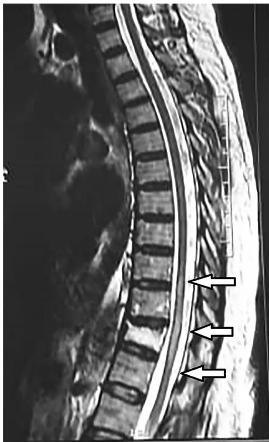
Fig. 2 longitudinally thoracic extensive transverse myelitis T2sagittal spinal cord MRI

the best of our knowledge, here in the present study, we have reported the first para infection post-COVID; longitudinally extensive transverse myelitis (LETM). It seems post-COVID CNS autoimmunity is a possible concern after the initial presentation of COVID.