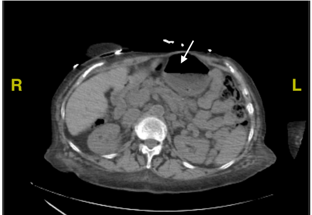
FIGURE 2: CT Abdomen and Pelvis showing gastric remnant with collection of blood

abnormalities in the remnant, which was suspected to be a collection of coagulated blood from an upper gastrointestinal bleed. An esophagogastroduodenoscopy (EGD) was performed and the fistula was closed via clips. Following the procedure, there was a sudden improvement in her nausea and abdominal pain. Her serum ammonia levels continued to fluctuate throughout the hospital stay (Figure 1) without any correlation to mental status changes.