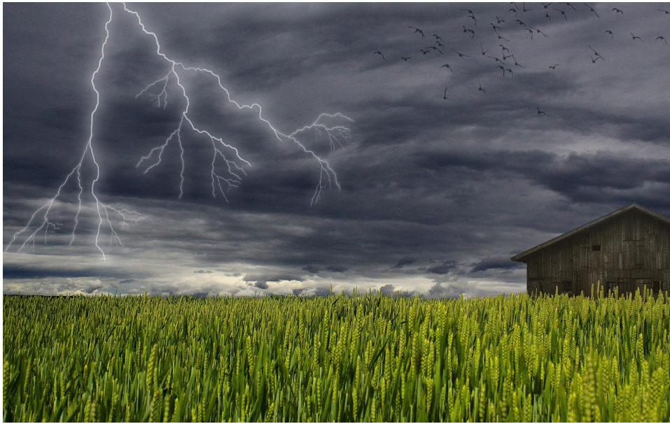
Figure 2 Picture of all elements required for a thunderstorm asthma epidemic: storm activity, presence of aeroallergen (in this case grass pollen), and human presence as shown by building.

near-surface air warming effects. 31 Secondly, changes to climate alter the growth patterns of allergen-producing plants and the production and dispersion of triggering pollens; with increasing atmospheric carbon dioxide levels predisposing plants to produce more pollen, this could substantially increase the risk of severe thunderstorm asthma events. 29 Thunderstorm asthma events are also more likely to occur in previously unaffected regions and outside of usual seasons due to these changes.