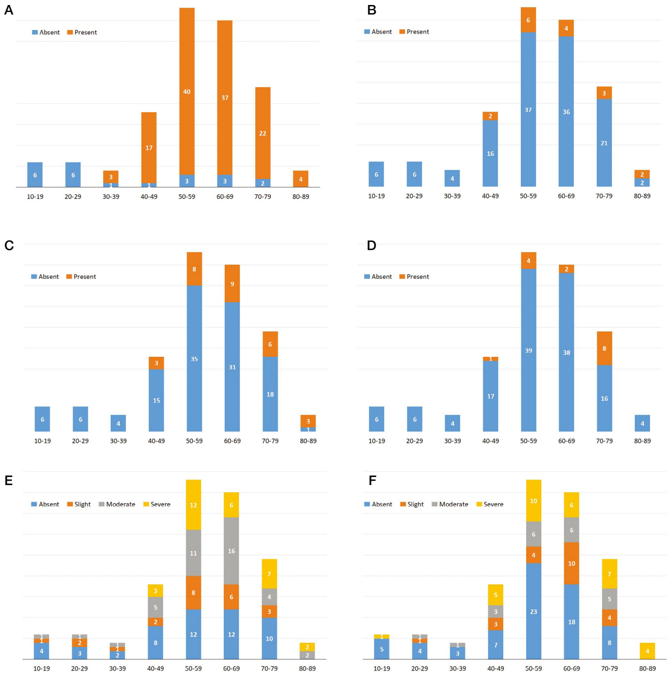
Fig. 2. Age distribution of condylar degeneration on cone-beam computed tomographic images. A. Incidental findings of condylar flattening. B. Incidental findings of condylar resorption. C. Incidental findings of condylar sclerosis. D. Incidental findings of subcondylar cyst. E. Severity of osteophyte formation. F. Severity of condylar erosion.

aged 70-79 years, and 2 patients aged 80-89 years (Fig. 2E). A statistically significant linear association was found between the severity of osteophyte formation and age ( P < 0.05 ), suggesting that the severity of osteophyte formation increases with age. Severe condylar erosion was observed in 5 patients aged 40-49 years, 10 patients aged 50-59 years, 6 patients aged 60-69 years, 7 patients aged