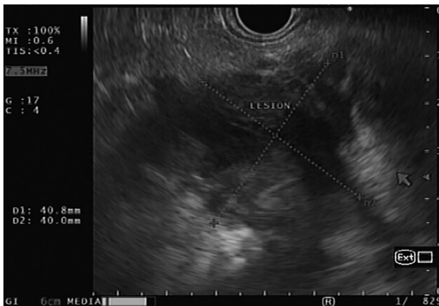
Fig. 1. Endoscopic ultrasonography image with a multisepated predominantly cystic mass in the head/neck of the pancreas.