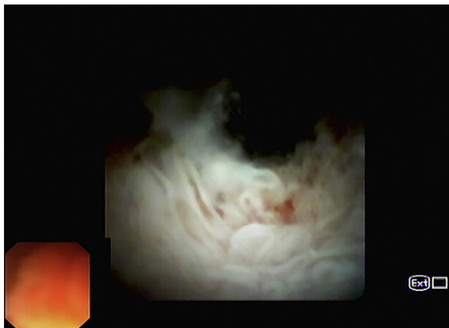
Fig. 4. Pancreatotomy image showing the presence of mucin in the head and neck of the pancreas, papillary fronds, and protrusions with a “fish-egg” appearance.

sions were observed in the biopsies performed in the body and tail region. The patient was submitted to a subtotal duodenopancreatectomy. Surgical specimen histology confirmed the previously reported findings and associated presence of a focal ductal adenocarcinoma, with 15 mm of extension (pT1bN0R0). The patient remains well 1 year after surgery, with no evidence of disease recurrence in the follow-up.