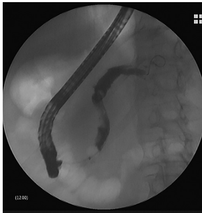
Fig. 3. Fluoroscopic image after contrast instillation with diffuse MPD dilation.

Biopsies using SpyBite™ forceps were performed in the different MPD segments (at least 3 samples per segment). SpyBite™ was passed along the accessory channel of the scope after removal of the wire. We usually lubricate the forceps using silicone spray to facilitate the passage. The