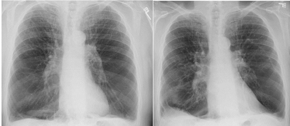
Figure 3: A posteroanterior (PA) chest X-ray comparing preoperative (left) to postoperative (right).