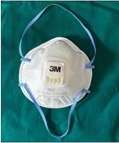
Figure 2: Filtering facepiece respirator

of the respiratory tract and subsequently get expelled via nasal secretions or the mucociliary escalator, inhaled aerosols can penetrate into the depths of the lung and may be deposited in the alveoli. A study comparing the aerosol and surface stability of the SARS-CoV-2 virus showed that the novel coronavirus remained viable in aerosols with only a slight reduction in infectivity at the end of 3 h. [10] As we now know, the SARS-CoV-2 is carried by both droplets and aerosols, and hence, an N-95 is essential for the protection of HCWs exposed to these patients.