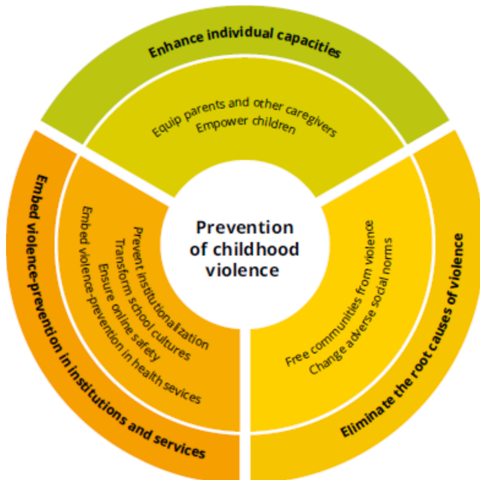
Fig. 2. Prevention of childhood violence.