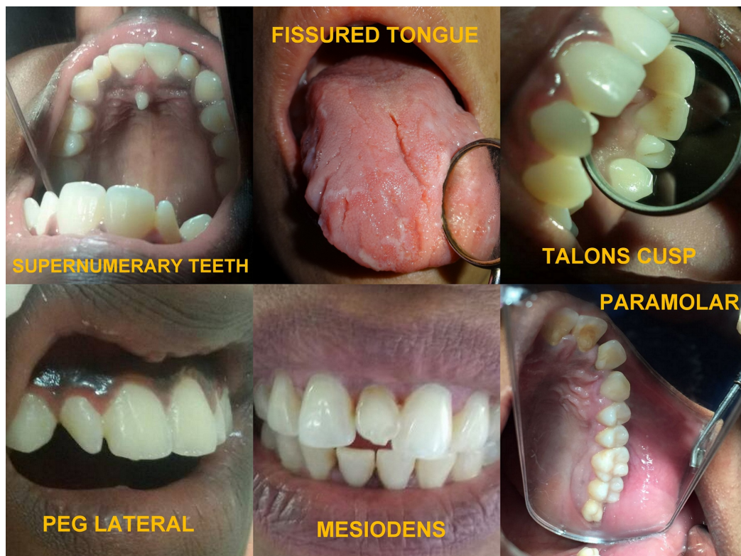
FIGURE 2: Photographic representation of the developmental anomalies

From the clinical study of 500 patients, it was noted that 12.2% (Table 1) of the study population were detected with anomalies. Of these, 57.1% were men. A detailed listing of the results is given in Table 1. Clinical photographs of the anomalies seen are provided in Figure 2.