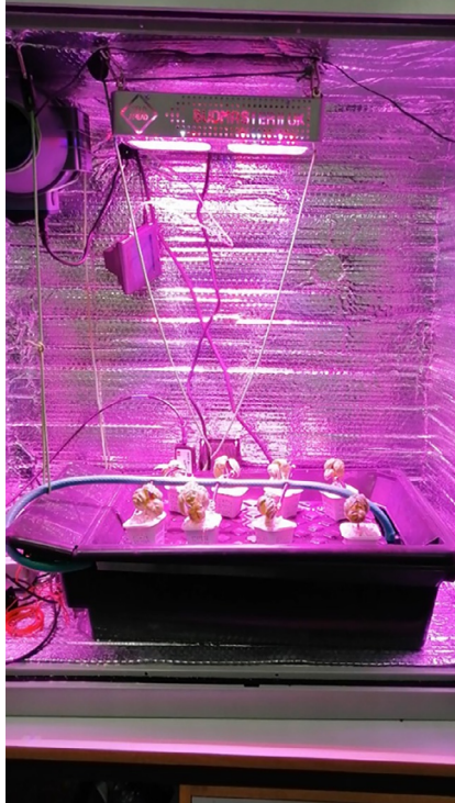
Fig. 2 Indoor farming small scale unit with additional reflectors.

calculations of Kublic et al. (2015) it was estimated that the average irrigation duration for lettuce is four and a half hours of total pumping daily.