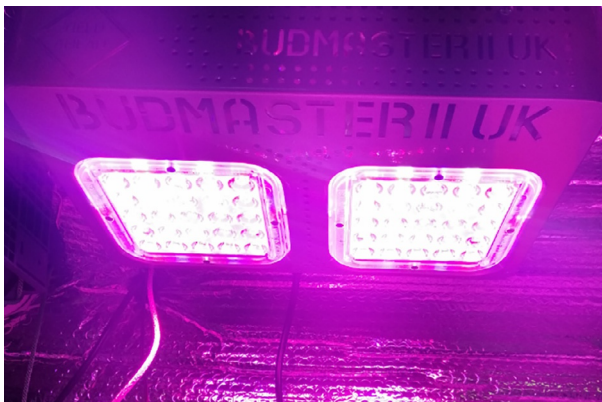
Fig. 3 Upward lighting, and use of reflectors in a small-scale experimental unit.

Based on the calculations and experiments conducted by Yokoi et al., 2003, it is shown that indoor vertical farms have 1.9 to 2.5 times higher LUE_p in comparison to the greenhouses. Only 1% of the light energy is actually converted into salable portion of plants. Nevertheless, there are different techniques which can be applied and can improve the conversion factor to 3% or a little higher. A simple technique that can be followed is the application of interplant lighting, upward lighting, and use of reflectors (Fig. 3). Traditional lighting that is located only on top of the crop can cause undesirable shading in dense crops by uneven light distribution and lead to senescence of the leaves that are in lower levels. On the contrary, the