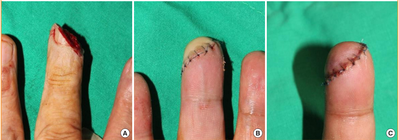
Fig. 3. Example of failure

(A) Preoperative photo of a patient who was injured in a lateral oblique pattern. (B) Immediate postoperative photo; a pale color was observed. (C) Two weeks after the operation, the fingertip had recovered to gain a pinkish color after revascularization was completed.