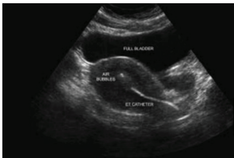
Figure 1. Transabdominal ultrasound viewing embryo transfer catheter and presence of air bubble at the fundus (19).

Chemical pregnancy was defined as the serum Beta HCG level > 25 IU/l within 14 days after the embryo transfer. In addition, clinical pregnancy was considered by detecting the fetal heart activity and determining the number of gestational sacs via transvaginal or abdominal ultrasonography within 2-3 wk after the confirmation of positive \beta -HCG. Abortion was described as the loss of pregnancy within 6-7 and < 20 wk, and ongoing pregnancy was defined as pregnancy proceeding beyond \geq 20 wk of gestation. In the present study, the implantation rate was defined as the number of identified gestational sacs in ultrasonography per the number of the transferred embryos. Both study groups were matched in terms of the outcomes, and luteal phase support was sustained until the 10 th week of gestation.