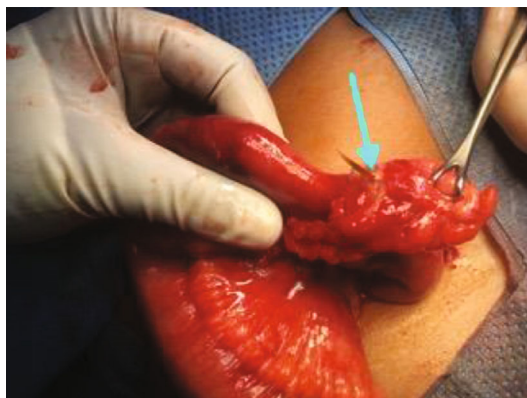
FIGURE 5: Foreign body seen perforating Meckel's diverticulum in case 5 (arrow).

the flexures of the colon [3, 7, 10] and rarely involve Meckel's diverticulum or appendix [11]. Patients usually present with acute abdominal pain but the diagnosis is often missed as this is a rare incident, and they usually do not recall fish bone ingestion [12]. In our cases, none of the patients were asked about the history of fish ingestion preoperatively, and only half of them gave the history of fish intake couple of days prior to the abdominal pain. Some of the patients present with pain at the lower abdomen especially in the right side mimicking acute appendicitis as was the case with two of our patients. Different signs have been described including localized abdominal abscess, colorectal, colovesical, and enterovesical fistula, inflammatory mass, chronic or acute intestinal obstruction, bleeding, endocarditis, renal, and