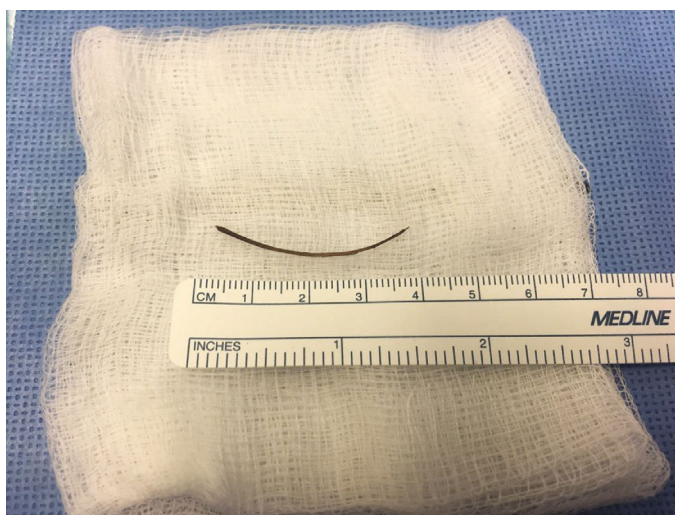
FIGURE 3: Postoperative fish bone specimen in case number 4.

In cases 5 and 6, the clinical picture and abdominal examination was consistent with acute appendicitis. An open procedure by grid iron incision was carried out as the patients were thin and lean. We found the fish bone perforating Meckel's diverticulum in both cases. The fish bone was removed along with the resection of the segment of small bowel with perforated Meckel's diverticulum as the base of both diverticulae were thick and had abnormal consistency especially the case number 6 (Figure 6). The continuity of the bowel was restored by side-to-side anastomosis using GIA (gastrointestinal anastomosis) stapler along with appendectomy (Figures 6 and 7). Histopathology of Meckel's diverticulum, however, did not show any abnormal mucosa, whereas that of appendix revealed mild inflammation in both. All patients tolerated the surgical procedures well and had unremarkable postoperative course and were discharged within 3 to 5 days after the surgery. All patient received a single dose of intravenous cefuroxime 1.5 grams at the induction