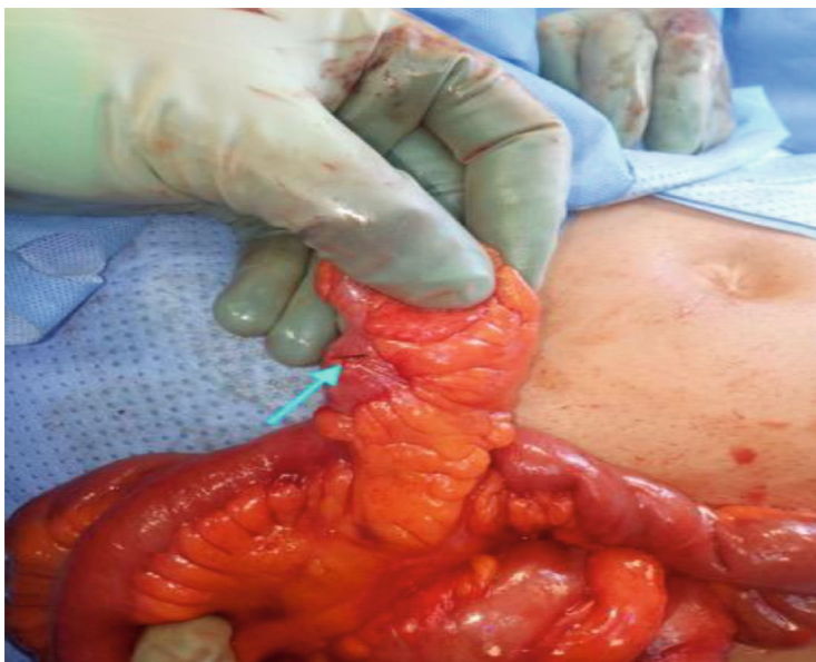
FIGURE 6: Meckel's diverticulum containing the fish bone penetrating it in case 6.