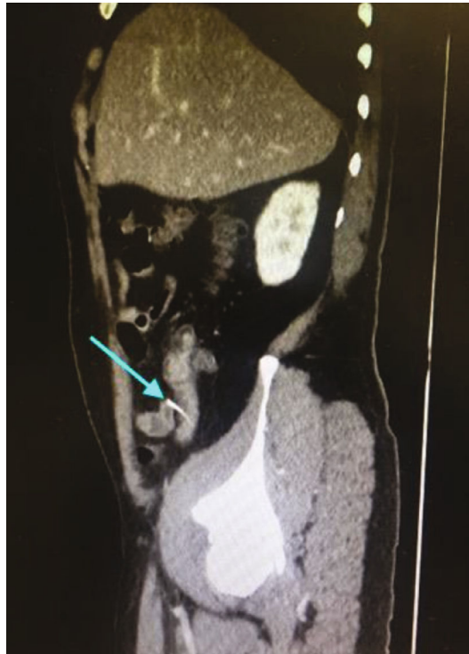
FIGURE 4: CT scan of case number 3 showing foreign body (arrow).