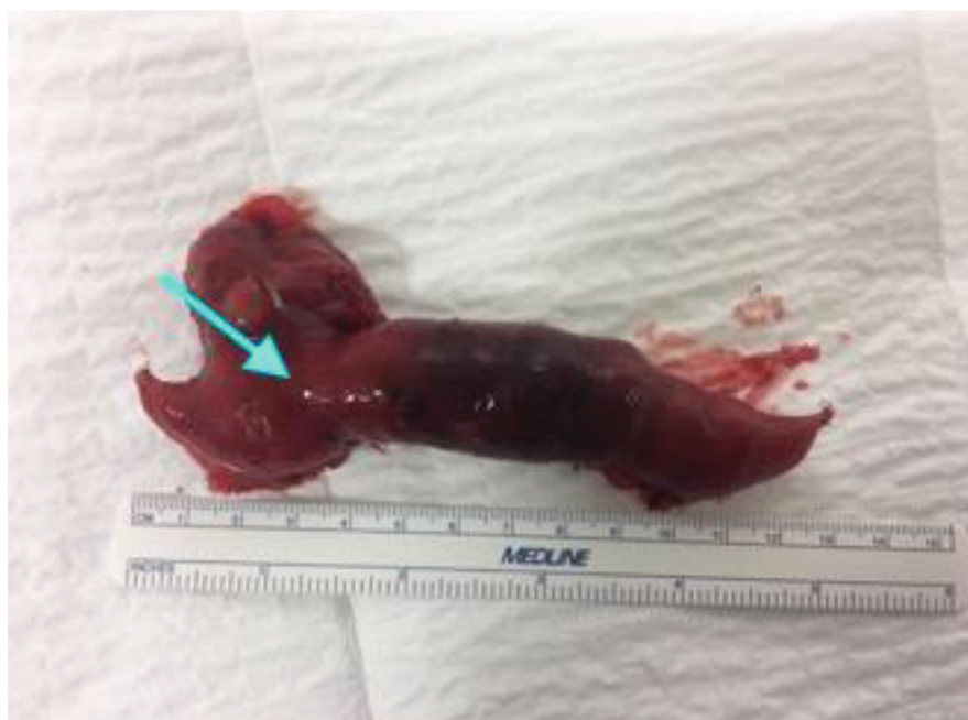
FIGURE 7: Meckel's diverticulum specimen case 5.

laparotomy or traditional appendectomy incision as we did in two patients who were found to have perforation of Meckel's diverticulum despite that they had all the classic clinical features of acute appendicitis and therefore, no imaging was done. Most of the previously reported cases were managed operatively with the resection of small bowel and anastomosis [3, 17]. The benefit of laparoscopy for appendectomy and as a tool for the initial exploration of abdominal sepsis has helped in diagnosing this type of rare condition, avoiding the need of laparotomy in many patients [18].