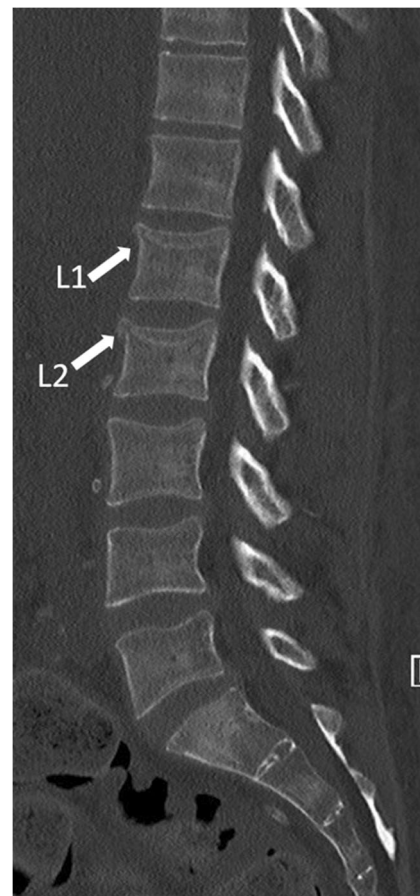
Fig. 3 30-year-old female with reported fall. Sagittal CT of the lumbar spine shows acute mild compression fractures of L1 and L2 with avulsion of the superior-anterior aspects