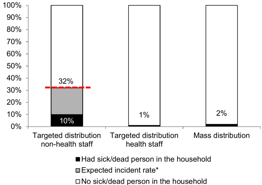
Fig 2. Incidence of sickness and/or death among household disinfection kit recipients, during the Médecins Sans Frontières response to the Ebola Virus Disease outbreak in Monrovia, Liberia, 2014. * Attack rate estimated at 32% for close household contacts [95% confidence interval (CI) 26–38%], without using the protective kit (Brainard et al, 2015).

https://doi.org/10.1371/journal.pntd.0008539.g002