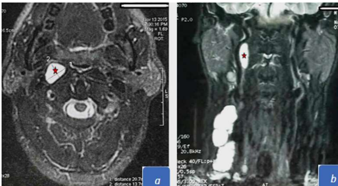
Figure 2: MRI showing enhanced lymph node swelling in the right retropharyngeal space which doesn't dislocate the internal carotid artery; a) axial T2 weighted with fat-suppressed; b) coronal T2 weighted with fat-suppressed