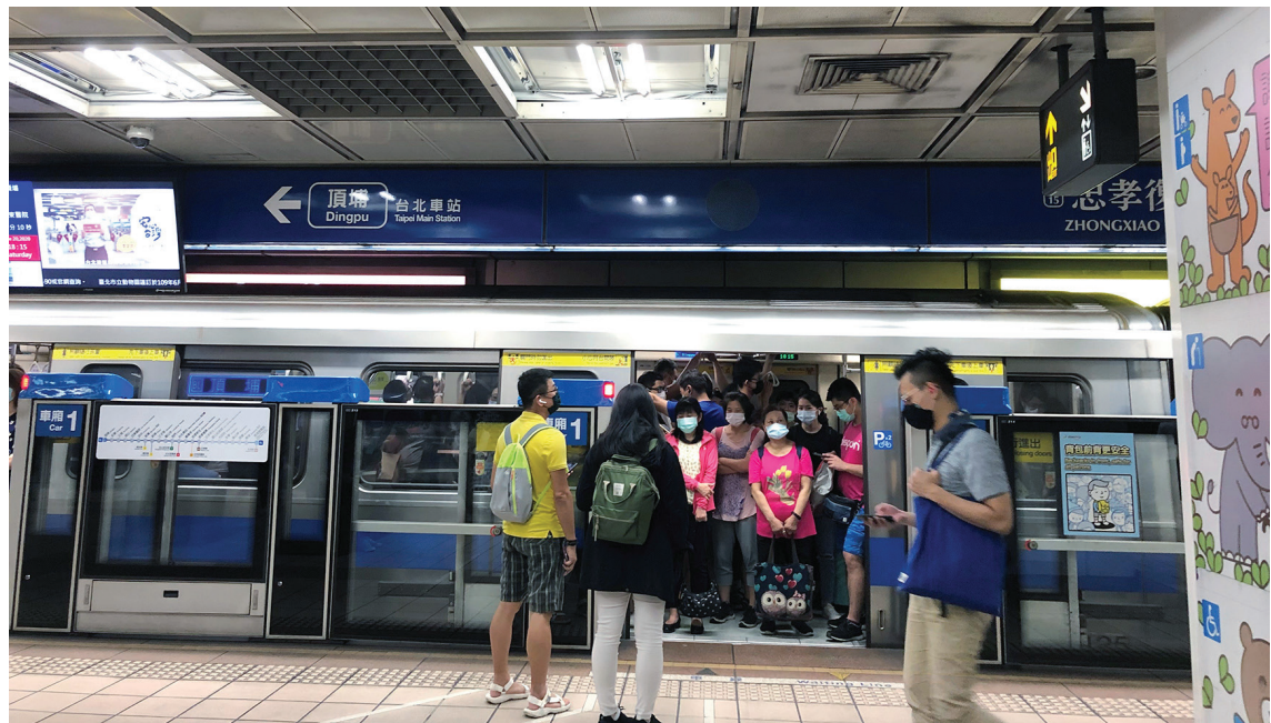
Photo: The metro in Taipei, Taiwan (from Cheryl Lin’s collection (used with permission)).

Taiwan’s low case number could be attributed to a strict yet thoughtful quarantine model, from preemptive health screening by CDC-surveilled airport border control to meticulous contact tracing and self-quarantine, utilizing both incentives and deterrents with wraparound services. Suspected cases self-reported or detected at airports are tested onsite and transferred to hospitals. Passengers arriving from