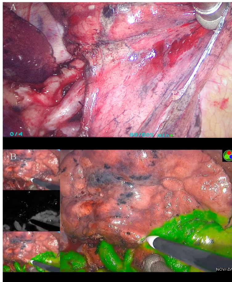
Fig. 3 The intersegmental plane visualisation during thoracoscopic segmentectomy. a: The intersegmental plane was not clear using inflation-deflation method, b: near-infrared intraoperative imaging with indocyanine green is associated with better intersegmental plane visualization

fluorescent green. a clear delineation of the intersegmental plane was then identified as the line separating the dark lung parenchyma from the green lung parenchyma. When pulmonary artery was properly dissected, delineation of the intersegmental plane could be identified about 15 s after injection of ICG. The operation time was significantly shortened. Besides, the brightness of ICG fluorescence mainly depends on both the ICG concentration in blood vessels and the blood flow in the pulmonary artery [14], it is also influenced by the condition of the pulmonary parenchyma, including anthracosis and emphysema [15]. It may be difficult to clearly visualize the entire intersegmental plane using ICG in patients with severe emphysema, as the blood flow in emphysematous regions is quite low.