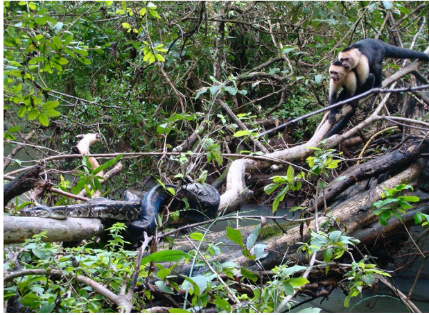
Figure 1. An alpha male and a subadult male white-faced capuchin cooperatively threaten a Boa constrictor in the SSR, Costa Rica.

aftermath. Additionally, we analyzed the video in QuickTime using the frame by frame function. Figure 2 is a screen shot from the video.