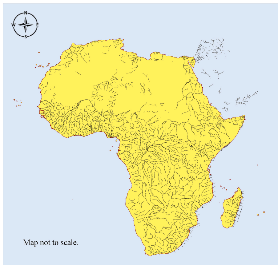
Fig. 1. Topographic map of African River network.

Developing countries, mainly in Africa, are currently faced with adoption, implementation and valuation of water for ecosystem conservation and water quality management practices are still in the juvenile stage. This situation has strengthened the consumption of untreated water and enhanced untreated water discharged into rivers. Similar reported cases have been documented in Ethiopia, and findings have been concluded that gross pollution of many rivers is a consequential result of rapidly increasing urban populations and intense industrial and agricultural activities ( Beyene et al., 2012 ). The ultimate goal of drinking water supply as declared by water resources engineers in developing countries is to provide good water quality, not only on the verge of leaving the treatment plant but at the customer's tap and point of discharge. However, most researches have failed to assess water pollution in the course of distribution. According to Prest et al. (2016) , treated drinking water enters a distribution system containing physical particles, microbial loads (cells) and nutrient loads (organic and