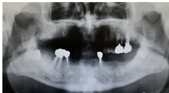
FIGURE 1: Panoramiograph showing the patient's teeth before the first extractions.