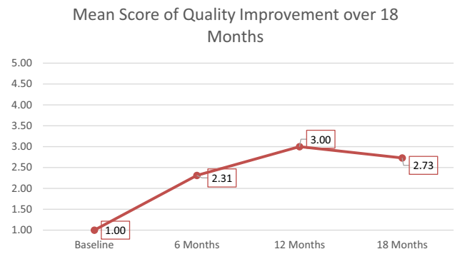
Fig. 3 Mean score of Quality Improvement over 18 months