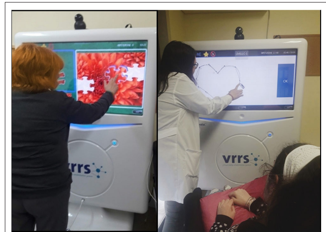
FIGURE 2 | The VRRS system: the Italian Telerehab tool used for both motor and cognitive rehabilitation.

Currently, in Italy, some health care centers use telerehabilitation for provision of health services. In particular, Bramanti et al.