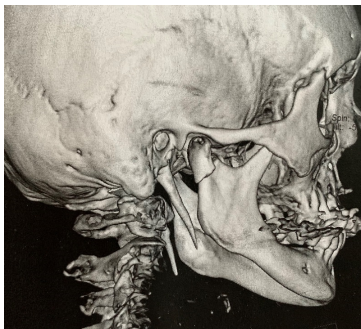
Figure 3. Three-dimensional computed tomography —an accidental finding of elongated styloid process in an asymptomatic patient with a fracture of the articular process of the mandible.

During the surgery, we used individual 3D printed models to measure and focus on identifying the exact location of the resection of the styloid process without damaging the surrounding anatomical structures (Figure 4). A Form2 3D printer (Formlabs) was used to create all preoperative models. PreForm software was used to design 3D models of the temporal bone, mandible and other anatomical structures. To assess the fidelity of the 3D printed model, we inspected it from all perspectives. The model was examined to determine whether specific anatomical structures were located correctly and had the appropriate shape. All 3D printed models were scanned by computed tomography (CT) with the same parameters as those of the original temporal bone and mandible. The window level and window width of all images were set at 1000 and 4000 HU. The reproducibility of anatomical traits of given structures such as the length, angulation, form and position of the styloid process; the exact location of the stylomastoid foramen; the transverse process of the atlas; and the distance from the ascending ramus of the mandible were evaluated by comparing CT images of the 3D models to the