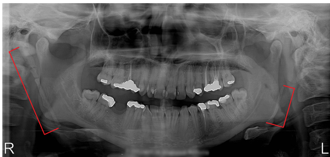
Figure 2. Panoramic radiograph of a patient with bilateral elongation of the styloid process.