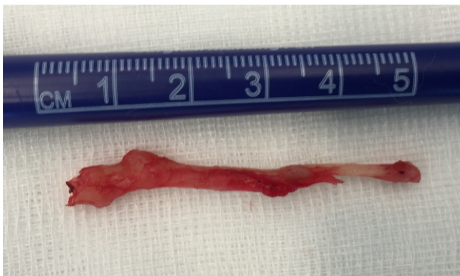
Figure 5. Resected elongated styloid process.

All five patients underwent resection of the styloid process from retromandibular approach; total of nine styloid processes were resected (length 4.8–7.2 cm; Figure 5). Postoperatively, four patients had immediate resolution of symptoms following their awakening in the recovery unit; one patient reported clinical improvement after 10 days. Patients were discharged from the hospital 3–5 days after the surgery, and had an uneventful post-operative course with minimal postoperative pain and swelling. Presently, 6 months after the surgery, all five patients are asymptomatic with minimal scarring and no peripheral neurological deficit.