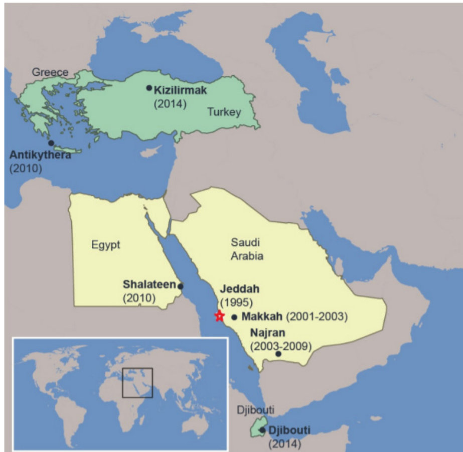
Figure 3. AHSV distribution in middle eastern countries. Yellow areas indicate human disease caused by AHSV in Egypt and Saudi Arabia. Greece, Turkey, and Djibouti (depicted in green) represent the places where viral RNA was found in ticks. Place, state, and year in which the first case was reported are provided. Star represents the place of the first human case.

possible that KFDV may have been present in India before 1957, but cases may not have been identified or reported [1,48]. Before 1957, the incidents of increased mortality in local NHPs in India was assumed to be caused by plague or influenza virus rather than a new disease [60]. However, a single human KFDV case has also been reported from China, in a region close to the Indian border [61] indicating that there might be more.