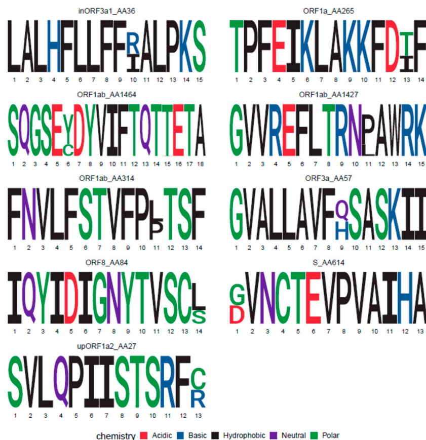
Figure 2. Sequence Logos for epitopes encompassing variable (>25%) positions. Protein location and starting amino acid positions are indicated on top of the logo.

Based on the SARS-CoV-2 alignment used to design the consensus, only nine amino acid positions in the entire SARS-CoV-2 genome showed two amino acids present in at least 25% of the sequences (Figure 2). Three of them were located in ORF1ab, one in the RNA polymerase and two in the Helicase sub-proteins. None of them were located close enough to each other to affect the same OLP. Still, the synthesis of a single consensus peptide could miss T cell responses in individuals exposed to the virus with the subdominant sequence variant. To prevent missing responses, a small number of additional OLP containing each of the variants were generated to cover the variability of these OLP, creating an additional set of 31 different variant OLP in the 15–11 OLP set (Table 2).