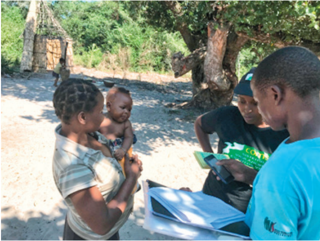
Photo: From COMSA Project showing interview of a mother with a baby. Data are collected directly on a phone (from the authors' own collection, used with permission).

SVRS complements and reinforces other existing systems, including Civil Registration and Vital Statistics (CRVS), Health Information Systems, and household surveys.