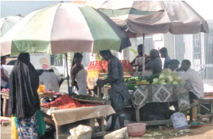
Photo: Vegetable and fruit open market in Lagos, Nigeria (from the author's own collection, used with permission).

In the fight against this global pandemic, curtailing the tide of infodemics is as important as breaking virus transmission and spread. First and foremost, it is imperative that the public must be educated about misleading messages and be taught the skills to decipher rudi-