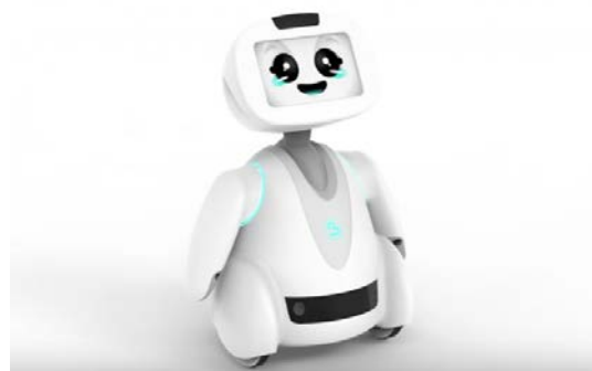
Figure 1. Social robotic product—Buddy Robot®.

Since technology has evolved and been applied in different daily contexts [1–4], the social robot, as one of the representatives of latest innovation, is an artificial intelligence system that could socially communicate and interact with human beings [5–7]. Different from traditional humanoid robots (e.g., robotic product, Zora Robot) that are physically embodied with specific human features, some latest social robots (e.g., robotic products, Jibo, Welbo, Misa, QTrobot, Hub, Mykie, and Buddy Robot) are designed with a screen, interfaced with an animated human-like face, to communicate and interact with people [8,9]. For example, Figure 1 shows the Buddy Robot, designed with human-like eyes and mouth, could emotionally accompany and interact with humans, and respond to human needs. Indeed, it might be necessary to design a head-like interface for a social robot to facilitate communication in the human-robot relationship [10,11] since social cognition and perception processes in humans might encourage people to generalize their human-related knowledge and recognition to form an expectation on the behavioral interaction with a social robot [12].