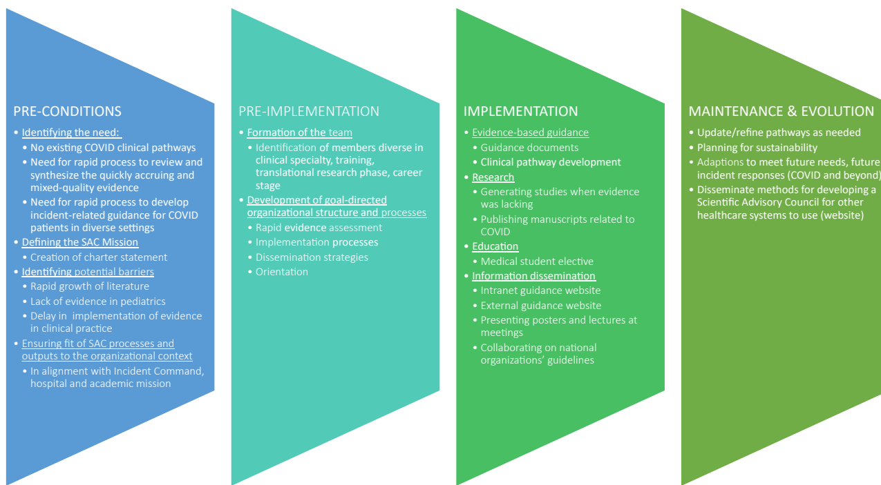
Figure 1. Application of each phase for development and implementation of CCREADS.